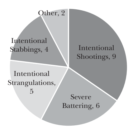
Figure 3 Mechanisms of Death in Actual Killer Cases

This survey also reveals how few of the cases present facts that raise a genuine doubt as to whether the killer adverted to the danger of death. Most of the cases involved intentional shootings (nine), strangulations (five), stabbings (four), or severe battering either of an infant or with a weapon, producing a brain injury (six).<sup>399</sup>